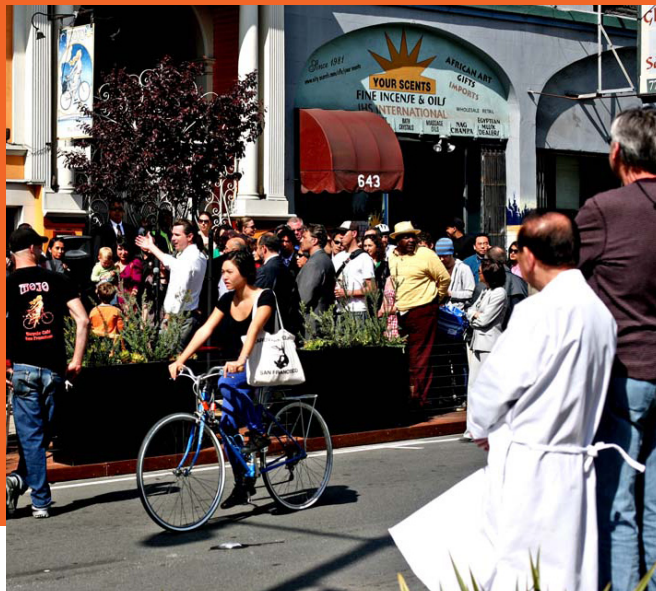
Above: The opening of San Francisco's parklet scheme as a core initiative of the Pavements to Parks program that was inspired by NYC but also Park(ING) Day.

Looking to our northern neighbour Brisbane, we keep hearing more and more positives stories and it doesn't seem to be slowing down. From hosting one of the world's largest PARK(ing) Days in